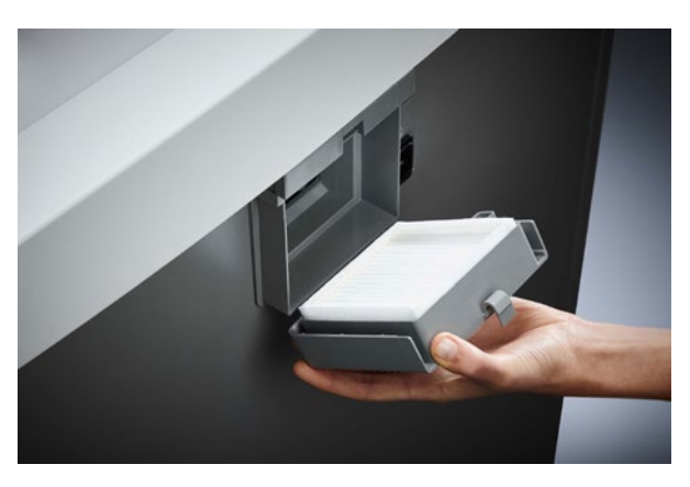
Dahle Waste 114air document shredder