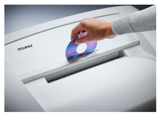
Separate CD feed opening with dedicated collection bin for environmentally friendly waste separation and secure destruction.