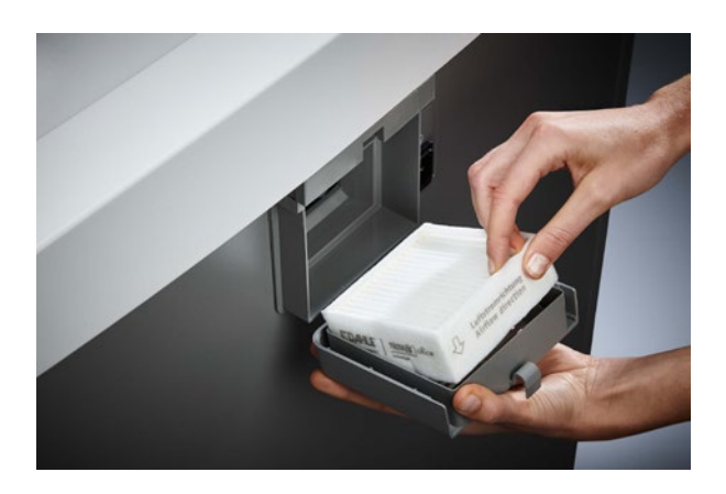
Improved indoor climate even when in heavy use: the unique DAHLE CleanTEC® filter system reduces fine dust pollution from the document shredder