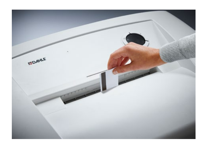
Reliably destroys cards