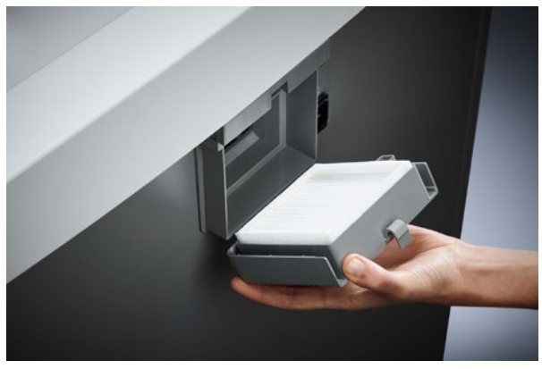
Dahle Waste 206air document shredder