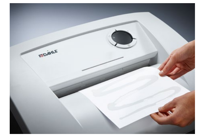
Dahle Waste 206air document shredder