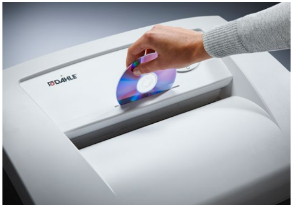
Separate CD feed opening with dedicated collection bin for environmentally friendly waste separation and secure destruction