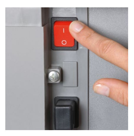
Separate main switch is located on the rear of the document shredder and completely disconnects it from the mains power supply