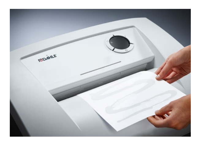
Dahle Waste 210 document shredder