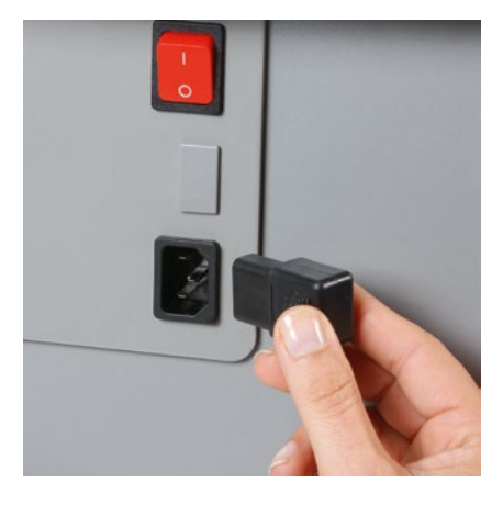
Detachable IEC power plug makes the document shredder quick and easy to move from A to B