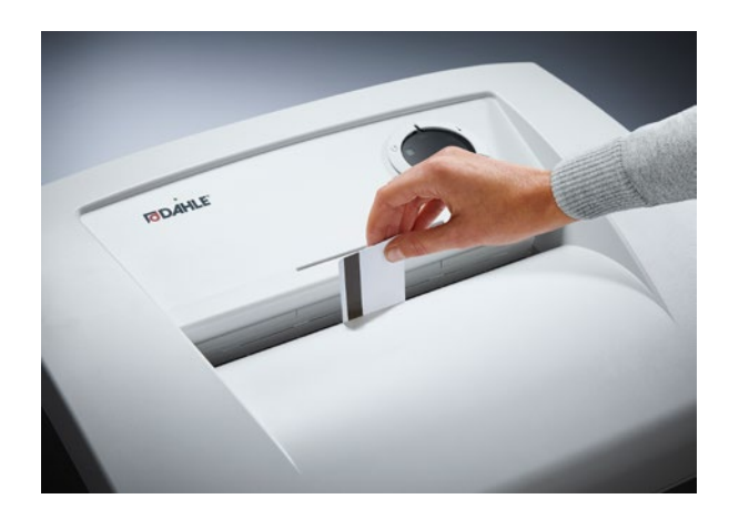
Reliably destroys cards