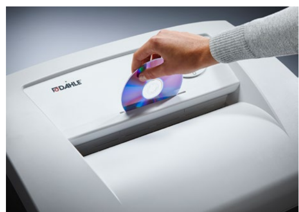
Separate CD feed opening with dedicated collection bin for environmentally friendly waste separation and secure destruction