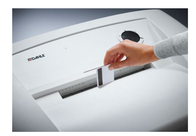
Reliably destroys cards