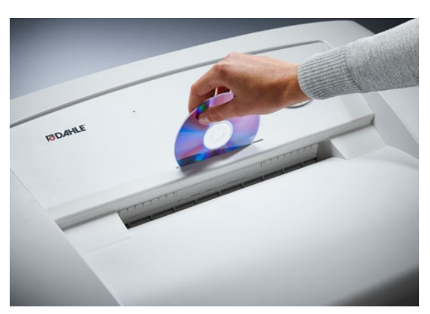
Separate CD feed opening with dedicated collection bin for environmentally friendly waste separation and secure destruction