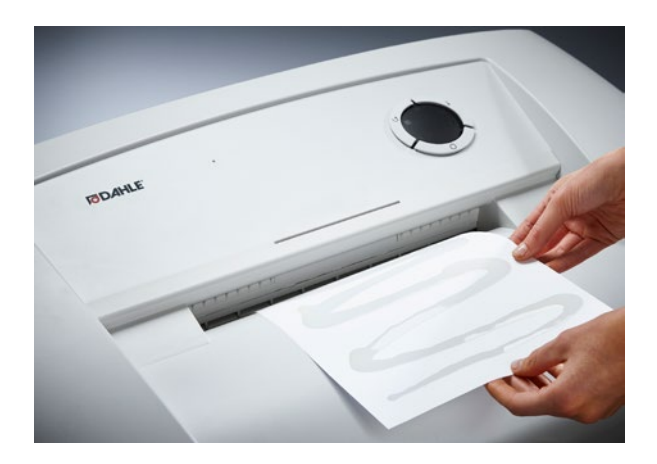
Dahle Waste 214 document shredder