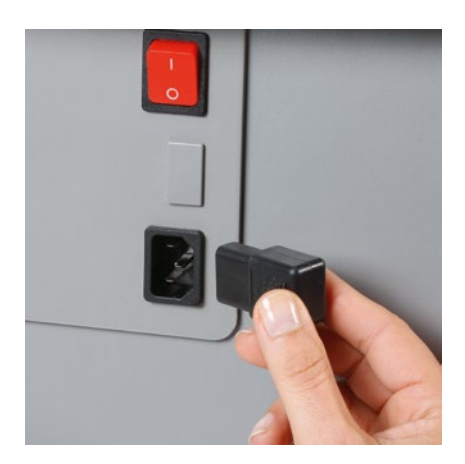
Detachable IEC power plug makes the document shredder quick and easy to move from A to B