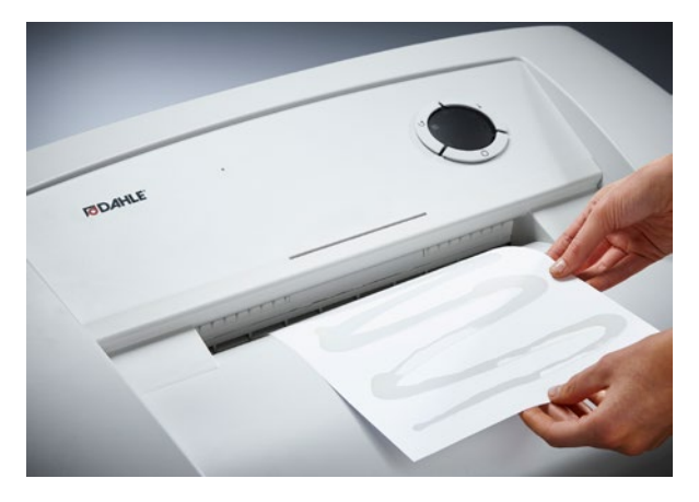
Dahle Waste 214air document shredder