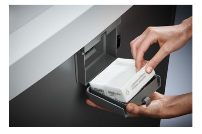
Improved indoor climate even when in heavy use: the unique DAHLE CleanTEC<sup>®</sup> filter system reduces fine dust pollution from the document shredder