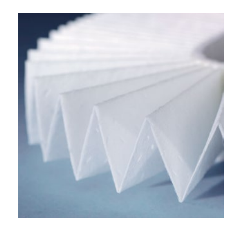
Environmentally friendly filter is made of special 3-ply, fully recyclable non-woven material