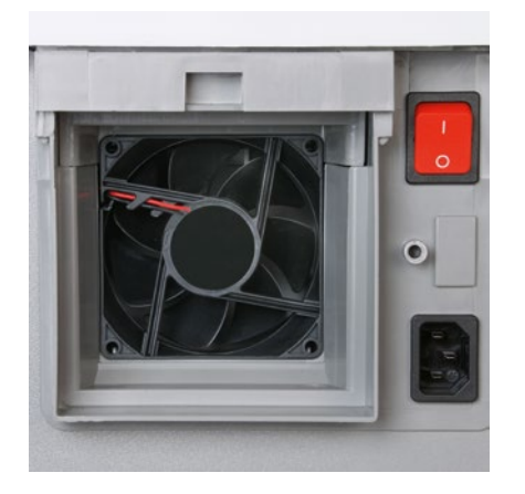
Powerful fan sucks in fine dust particles inside the document shredder and feeds them to the filter