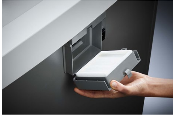
Dahle Waste 214air document shredder