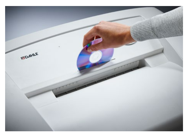
Separate CD feed opening with dedicated collection bin for environmentally friendly waste separation and secure destruction