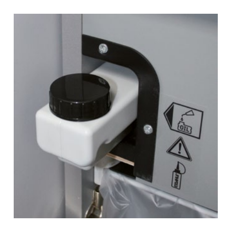
Integrated oil tank for controlled, automatic lubrication of the cross-cut cutters helps to lengthen service life while keeping performance constant