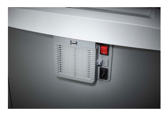
Separate main switch is located on the rear of the document shredder and completely disconnects it from the mains power supply