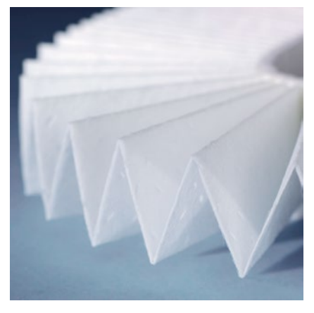
Environmentally friendly filter is made of special 3-ply, fully recyclable non-woven material