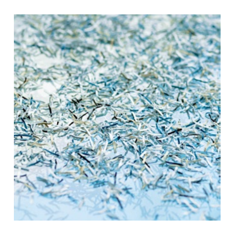
P-6 security: recommended for data media containing secret data demanding exceptionally stringent security measures