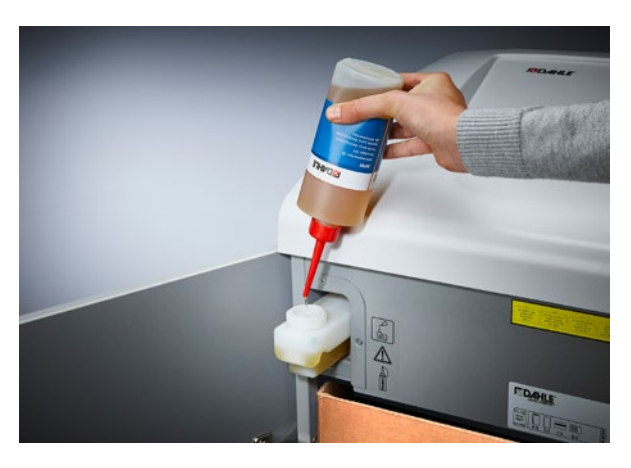
Automatic oiler for reliable shredding: simply fill with oil, the document shredder will take care of the rest