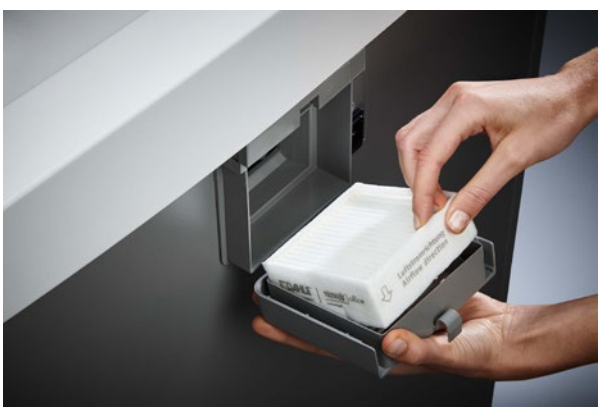
Improved indoor climate even when in heavy use: the unique DAHLE CleanTEC® filter system reduces fine dust pollution from the document shredder