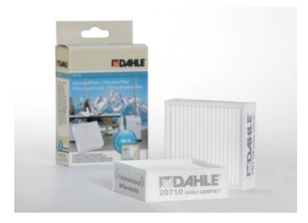
Fine particle filters Dahle 20710