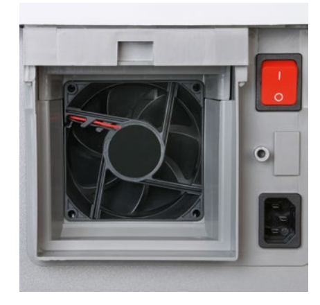
Powerful fan sucks in fine dust particles inside the document shredder and feeds them to the filter