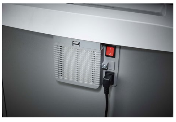
Detachable IEC power plug makes the document shredder quick and easy to move from A to B