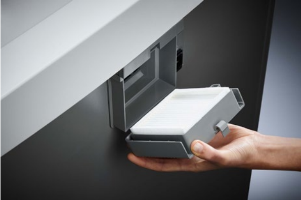
Dahle Top Secret 716air document shredder