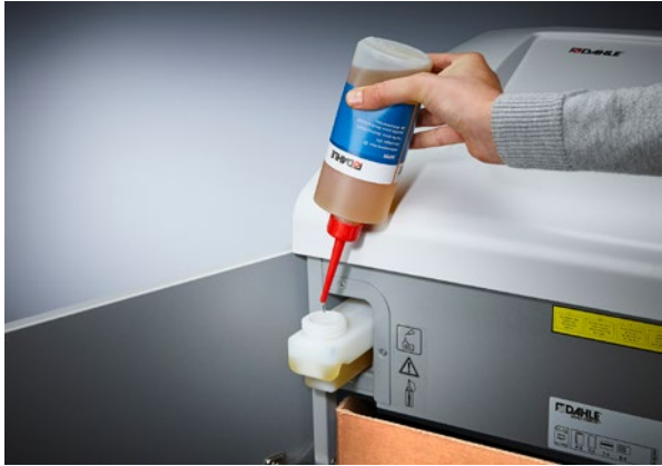
Automatic oiler for reliable shredding: simply fill with oil, the document shredder will take care of the rest