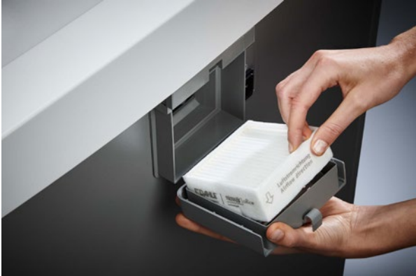
Improved indoor climate even when in heavy use: the unique DAHLE CleanTEC® filter system reduces fine dust pollution from the document shredder