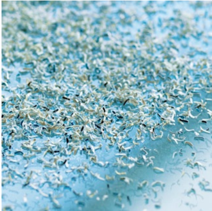
P-7 security: recommended for data media containing top secret data demanding maximum security measures